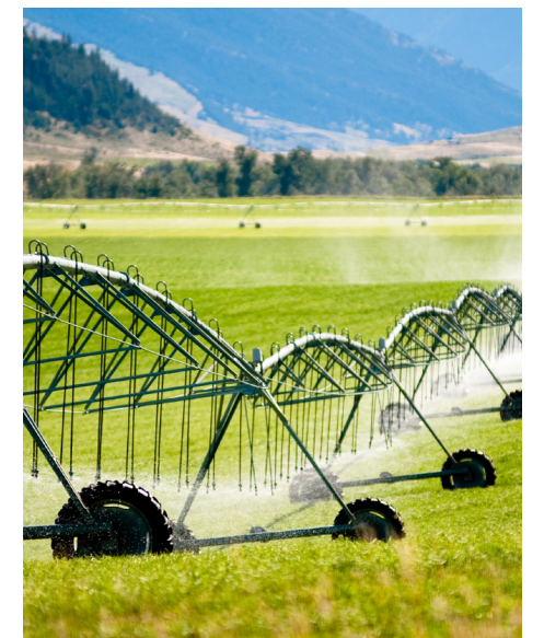
You should never allow a solid stream of water to hit a transmission line wire. Be sure to note the guidelines in this section.