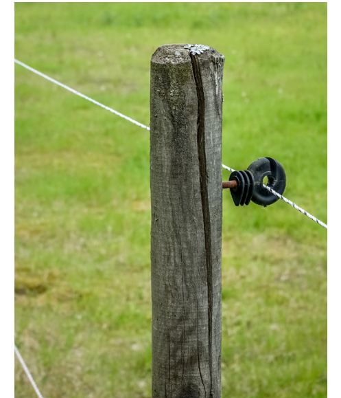
Electric fences are specially insulated from the ground and can pick up an induced charge from transmission lines.